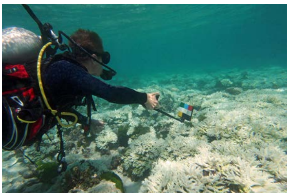
図 3 Coral bleaching observed by Dr.Suggett